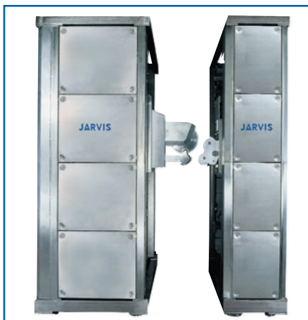
The Jarvis Model JCK-1 electric - automatic splitter for hogs.